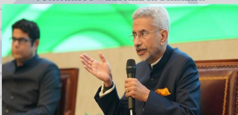
External Affairs Minister S. Jaishankar addressed the Indian diaspora in Manama, Bahrain

External Affairs Minister S. Jaishankar addressed the Indian diaspora in Manama, Bahrain on 10 December, highlighting the importance of strengthening India-Bahrain relations through continued engagement at various levels. He emphasized the growing bilateral trade, which has reached USD 1.7 billion, as well as the rise in investments and the welfare of Bahrain's