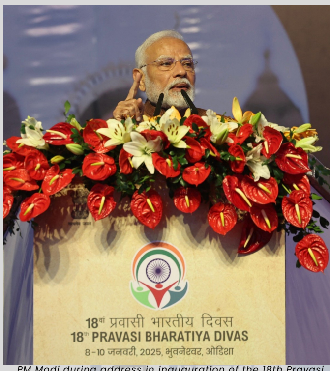
PM Modi during address in inauguration of the 18th Pravasi Bharatiya Divas (PBD) convention at Bhubaneswar

The 18th Pravasi Bharatiya Divas Convention (PBD), 2025 was held in partnership with the Government of Odisha in Bhubaneshwar, Odisha from 8 to 10 January 2025. This was the first PBD to be held in Eastern India. This approach is in line with Government of India's focus on 'Purvodaya'. Odisha has had historical maritime connections with South East Asia and these ties are being renewed and rekindled in contemporary times. As such, PBD 2025 in Odisha while deepening India's connect with the diaspora also strengthens its 'Act East Policy'. A large gathering of delegates from over 75 countries participated in PBD 2025.