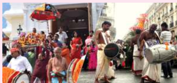
In Swindon, England, the Swindon Mitra Mandal and Swindon Hindu Temple collaboratively organized a public Ganeshotsav

Ganeshotsav included a dhol-tasha procession and cultural performances, attended by local dignitaries. Meanwhile, Yokohama, Japan, hosted a three-day festival filled with cultural activities, including a grand procession and performances, creating a joyful atmosphere.