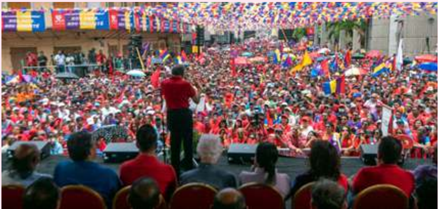
An election rally was held in the Mauritian capital, Port Louis

1. Dr. Navinchandra Ramgoolam - Prime Minister, Minister of Defence, Home Affairs and External Communications, Minister for Rodrigues, Outer Islands and Minister of Finance 2. Paul Berenger - Deputy Prime Minister & Minister without