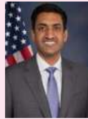
R O Khanna

Pramila Jayapal, the first South Asian American woman in the U.S. House,