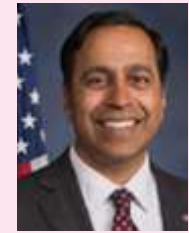
S. Raja Krishnamoorthi