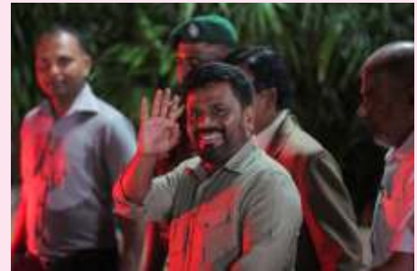
Anura Kumara Dissanayake, leader of the National People's Power (NPP) party

A striking feature of this election was the NPP's significant gains across the island, especially its success in the north and east, areas traditionally influenced by Tamil and Muslim communities. In Jaffna, the NPP won three out of six seats, becoming the first major southern party to challenge and defeat established northern Tamil political forces, such as the Ilankai Tamil Arasu Katchi (ITAK). This development has upended historical perceptions of the Janatha Vimukthi Peramuna (JVP), the NPP's primary constituent, which was long viewed as an "anti-Tamil rights" entity due to its staunch opposition in the 1980s to Tamil self-rule and the merger of the northern and eastern provinces.