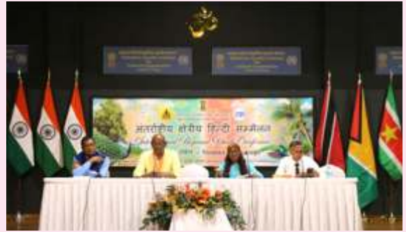
"हिंदी हृदय की भाषा है, संस्कृति की धरोहर को बचाना है": त्रि-दिवसीय अंतरराष्ट्रीय हिंदी सम्मेलन का उद्घाटन

वहीं, दूसरे सत्र में हिंदी भाषा सीखने के