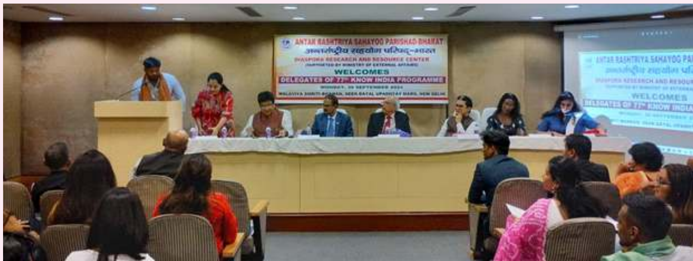
A member of the 77th KIP delegation sharing his experience with esteemed diplomats during an interaction session

On 12 September 2024 at Malaviya Smriti Bhawan, Diaspora Research and Resource Centre (DRRC) – Antar Rashtriya Sahayog Parishad (ARSP) hosted an interactive session for the 39 participants of the 77th KIP batch from 15 countries namely- Denmark, Fiji, Guyana, Kenya, Malaysia, Mauritius, Myanmar, New Zealand, Sri Lanka, Suriname, South Africa, Tanzania, Trinidad and Tobago, USA and Zimbabwe.