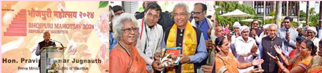
Glimpses of the Bhojpuri Mahotsav 2024 in Mauritius

The Bhojpuri Mahotsav 06-08 May 2024 commenced at the Long Beach Hotel in Belle Mare, marking a significant event that unites descendants of indentured labor immigrants to share their experiences and celebrate the Bhojpuri language and culture. The opening ceremony witnessed the presence of Prime Minister Mr. Pravin Kumar Jugnauth, alongside the Minister of Arts and Cultural Heritage, Mr. Avinash Teeluck.