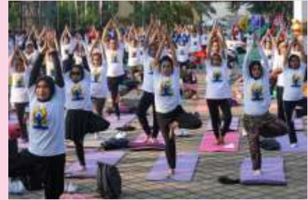
Practitioners strike a yoga pose at the Ministry of Youth and Sports in Jakarta, Indonesia.

Around the globe, people came together to practice various yoga