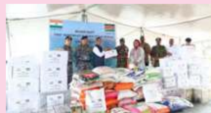
Indian Navy with relief materials

This benevolent initiative follows the swift response of the Indian Naval ship INS Sumedha, which reached Mombasa on May 10th, delivering vital HADR and medical supplies. Reflecting India's unwavering commitment to its longstanding friendship with Kenya, Prime Minister Narendra Modi reaffirmed the significance of South-South cooperation, emphasizing Africa's