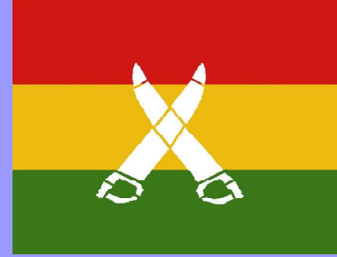
गदर पार्टी का चिन्ह