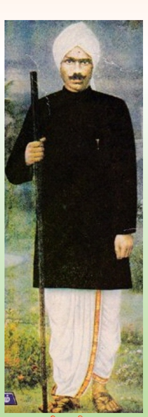
शुब्रह्मण्य भारती (11 व्हिसम्बर 1882) 11 सितम्बर 1921)